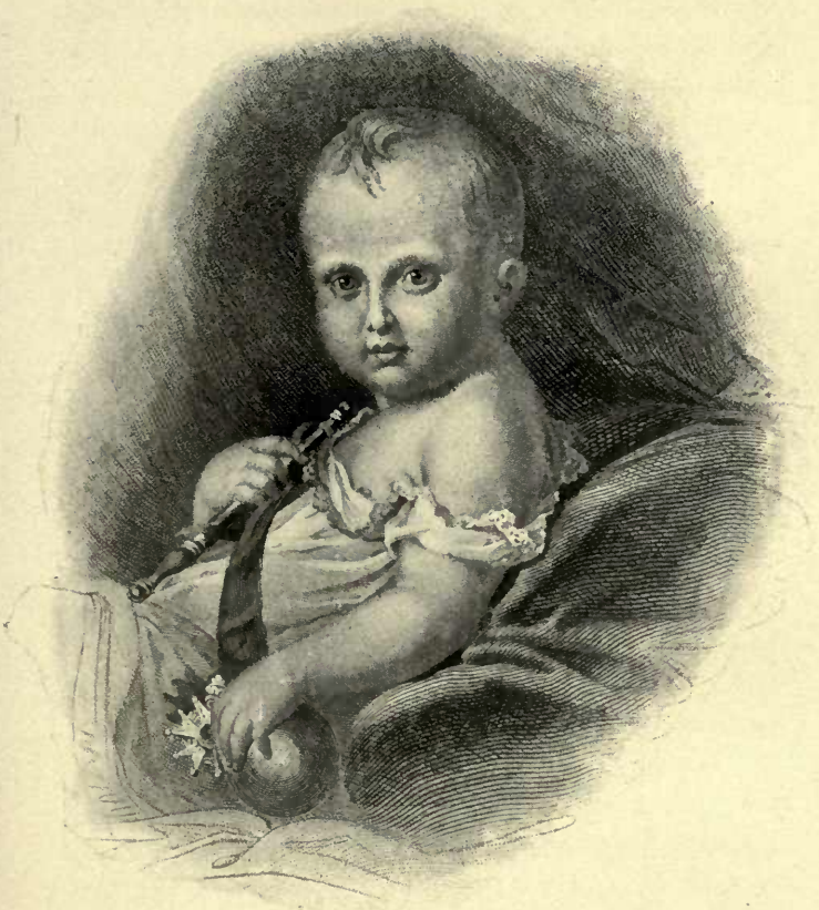
THE KING OF ROME